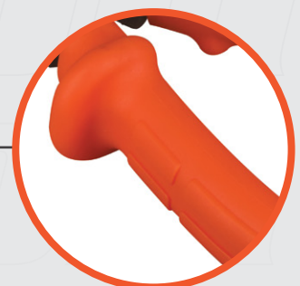
TPE Rubber 1000V Insulated Fusion Grip