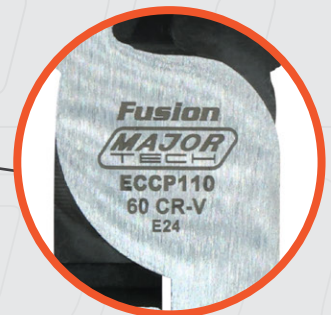
60CRV Chrome Vanadium Steel