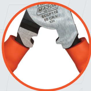
Terminal Crimping Slot