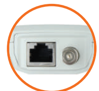
Integrated RJ45 & Coax F-Connectors interfaces on top of meter