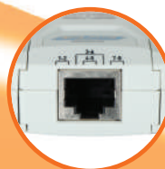
Remote for RJ45 Terminal